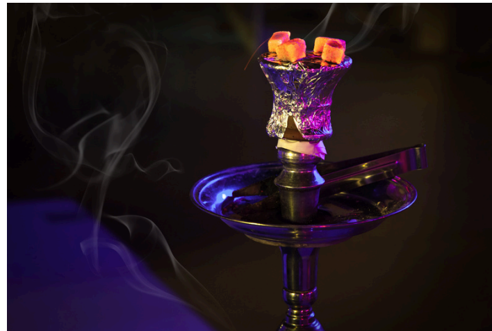
Mint + Watermelon + Ice