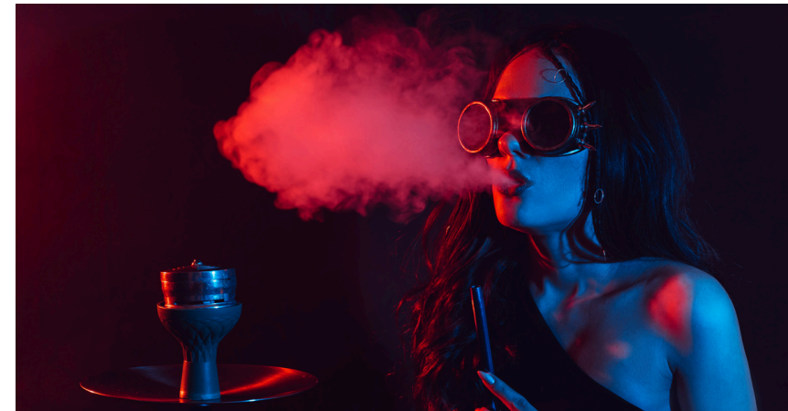
Mango + Pineapple