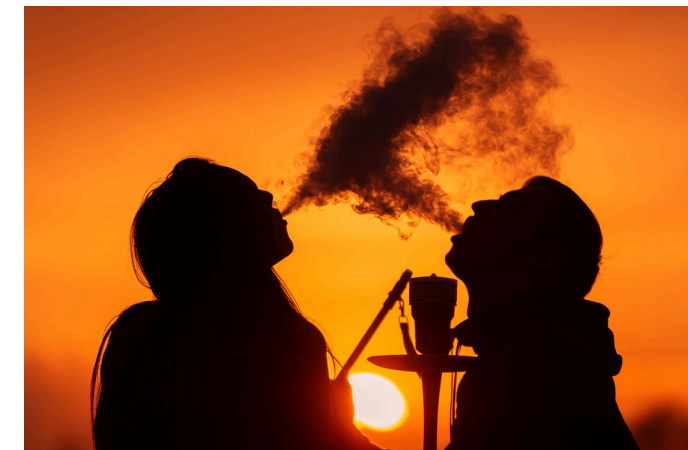
Blueberry + Mint